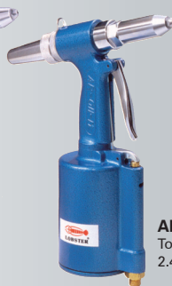
AR-011-M To set rivets from 2.4mm to 4.8mm