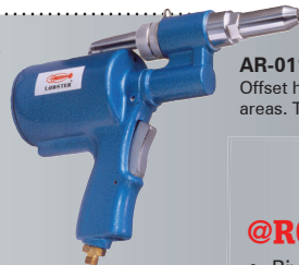
AR-011-P Offset head for access to tight clearance areas. To set rivets from 2.4mm to 4.8mm