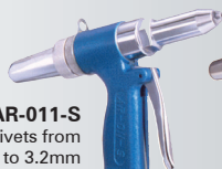
AR-011-S To set rivets from 2.4mm to 3.2mm

ARO21EXH - For Huck MAGNA-LOK® fasteners and other structural blind rivets 6.4mm only.